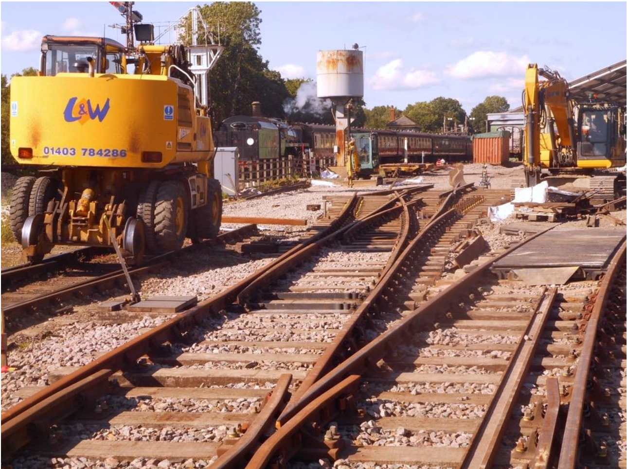
Three way point progress

F and G roads are already in place with stock sitting on them. They are already connected to the new trackwork south of the three way point. The points for H and J roads are also complete and in place. Only a few yards of plain track are required to finish H road but J road will not be completed until the wall between it and the heritage centre is built.