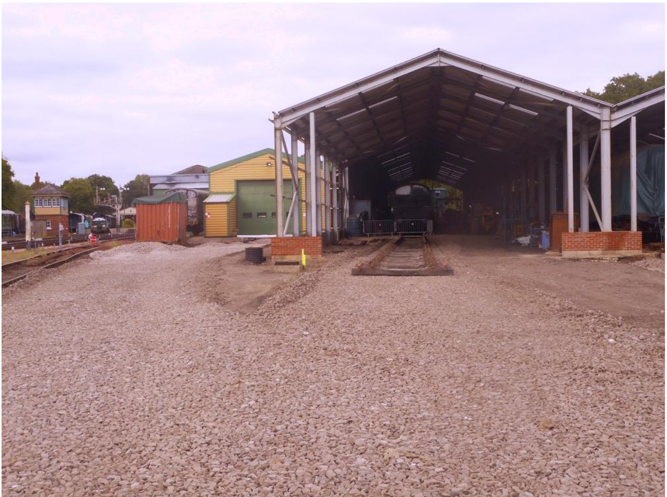
E road straight and level