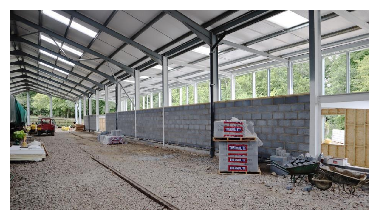
Blockwork on the ground-floor interior (shed) side of the HSC

The rear wall of the HSC is now 80% complete to first floor level (as above), with two bays left open for the time being to enable us to bring in the materials for the first floor. Now that the perimeter walls are in place the size of the building is more evident - approximately 250 \, \text{m}^2 on each of the two floors (as seen in the next two views).