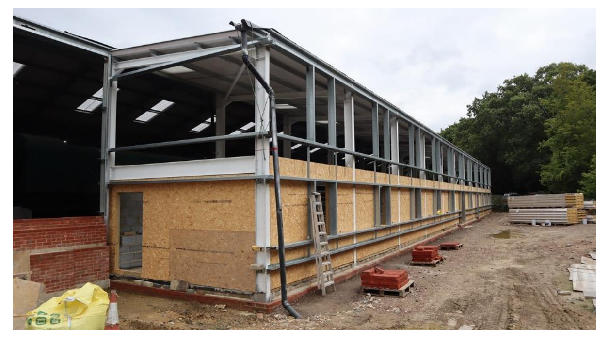
Completed ground-floor studwork

Arrangements are in hand to complete the dwarf wall below the cladding (seven more courses of brickwork) which will then lead onto the fixing of the cladding during September.