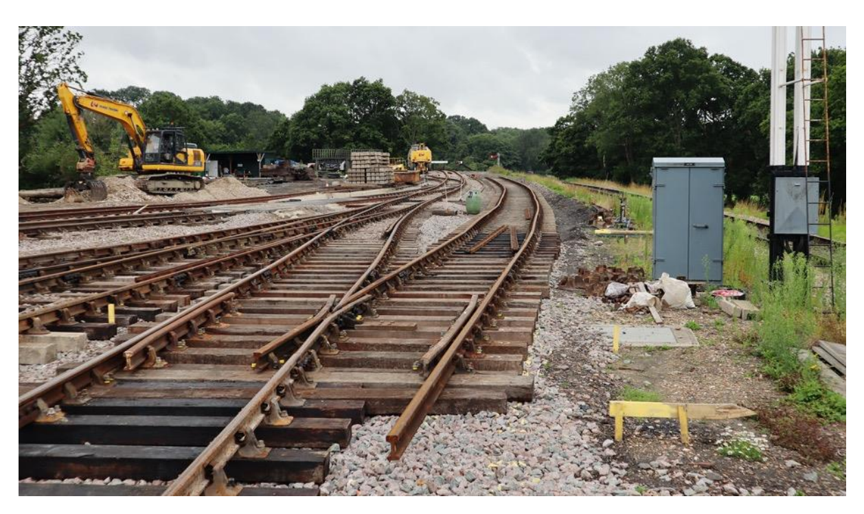
Crossing installed for new point

Outside the shed, more work has been done on the running-in road to complete the final turnout, and to reinstate the old headshunt (above). B and D roads are now permanently connected, enabling stock to be shunted out of B-road for the first time since the old pointwork failed a couple of years ago (below).