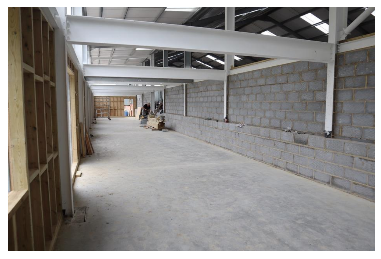
Interior of HSC, looking south

The rear wall of the HSC is now 80% complete to first floor level (as above), with two bays left open for the time being to enable us to bring in the materials for the first floor. Now that the perimeter walls are in place the size of the building is more evident - approximately 250 \, \text{m}^2 on each of the two floors (as seen in the next two views).