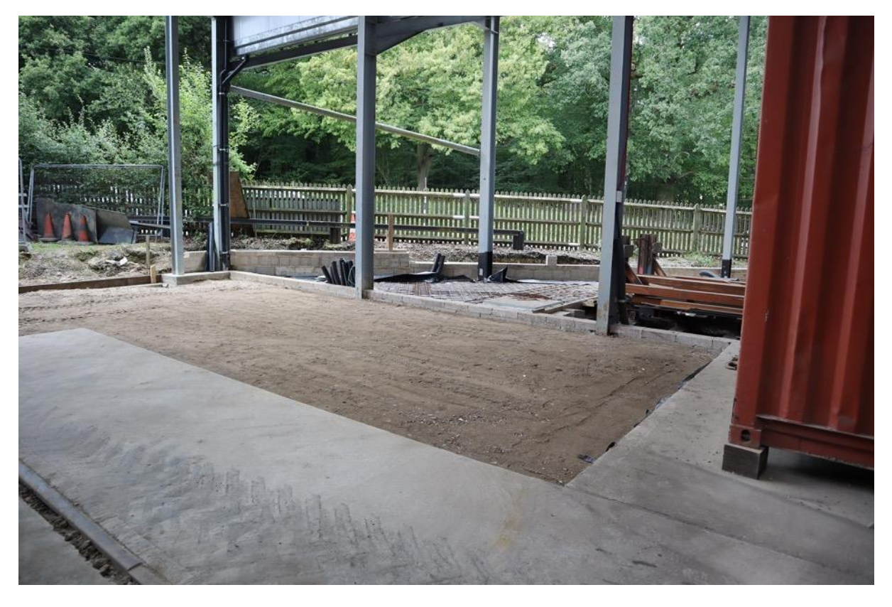
Preparations for concreting at the north end of the maintenance area

The final section of the concrete apron at the north end of E-road (the maintenance area) is in being prepared for concreting during the next couple of weeks, together with the floor for the new electrical distribution room at the north end of E road (seen below).