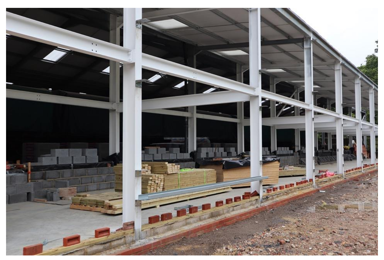
HSC steelwork cleaned, and painted with protective paint

The first stage of cleaning and painting of the steelwork with protective paint was completed during July (photo, below). The second stage, to spray the steel frame with fire-resistant 'intumescent' paint is almost complete, but slightly delayed, pending further deliveries of this specialist paint.