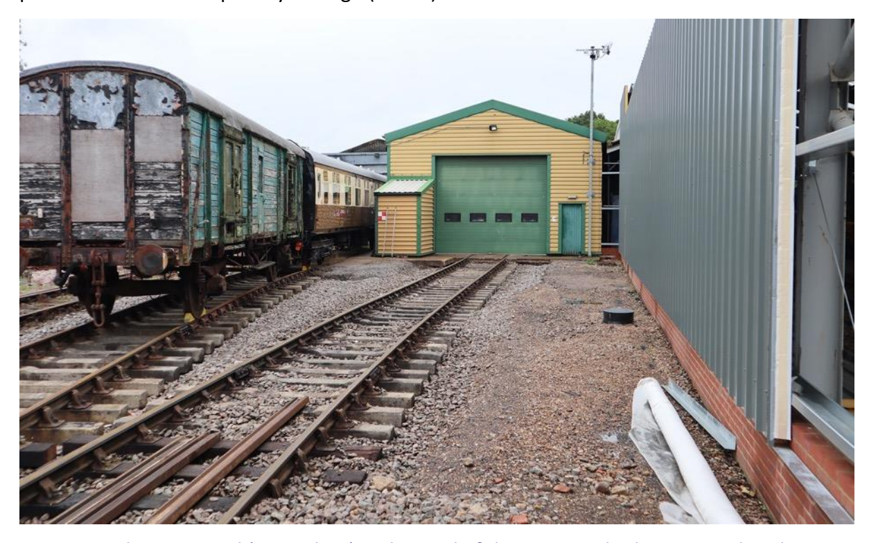
Track into D road (paint shop) and B road of the existing shed now completed

Outside the shed, more work has been done on the running-in road to complete the final turnout, and to reinstate the old headshunt (above). B and D roads are now permanently connected, enabling stock to be shunted out of B-road for the first time since the old pointwork failed a couple of years ago (below).