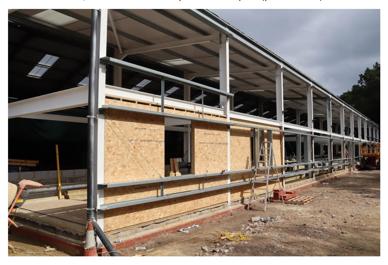
Fixing of cladding support rails in progress

The fixing of the support rails has progressed alongside the fitting of the ground floor external stud work, and both are now complete now complete (photos below).