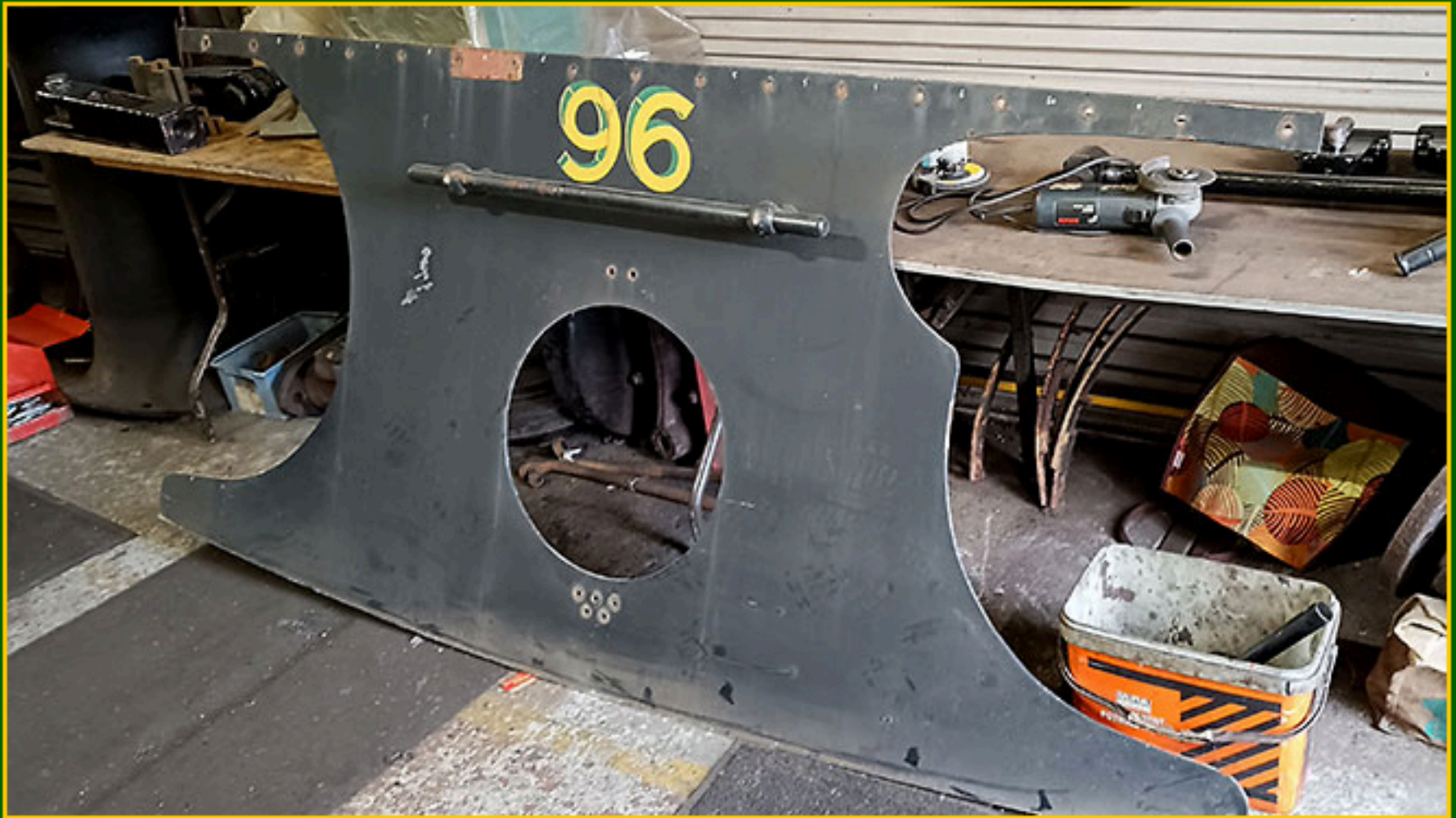
The rear section of cab which is be reused.

A couple of pictures showing the reusing of a rear section of the old cab being overhauled to form part of the new full cab rear section together with the lower rear section already in place. The other picture shows progress on the repainting of the frames and the erection of the brake rigging.