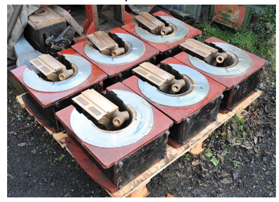
All six sets of Axleboxes and Keeps.

In our last issue we reported having completed the fitting of the coupled wheel horn guides. Since then all six axleboxes have been fitted to the corresponding coupled wheel sets and the machining of the axle box keeps has been completed. These are now stored under cover in readiness for setting the frames on the coupled wheels.