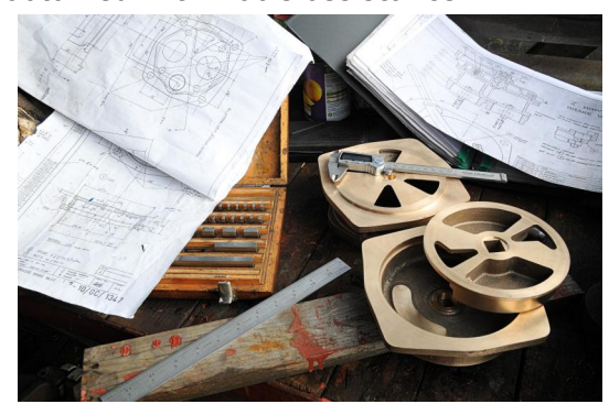
Parts for the Driver's Brake Valve.

Peter Wolfe is currently machining the driver's brake valve based on drawings obtained with Rob's assistance.