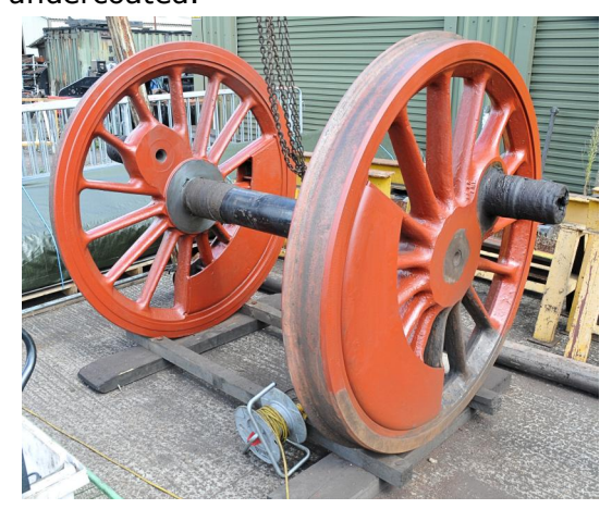
The Driving Wheel Set whilst being painted.

wheel sets and frames before wheeling. This is held up pending drier and warmer weather. All have been cleaned, external corrosion removed, primed and undercoated.