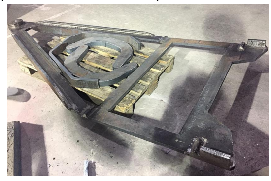
Radial Arm and Truck Parts at F&W.

This "presentation" will make the bunker a key feature for visitors on those occasions when the yard is open. The existing bunker drawings have been topped up with the help of the BRSLOG drawings service. We hope to get some shop drawings for the bunker prepared this winter with view to getting a pack of parts made in the new year.