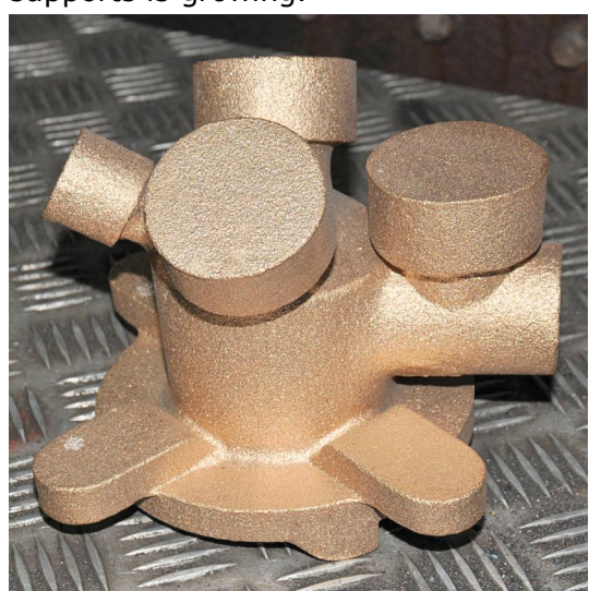
Casting for pedestal mounted sanding valve.

brake vacuum pipe-work is advancing from the rear and front buffer beam mountings towards the driver's brake pedestal where the complexity really begins. Good use is being made of the workshop's hydraulic bender and the Bullied Society's pipe threading machine, for which are very grateful. Winstanley at the BRSLOG drawings service has helped us with additional "cleaner" prints of the all-important pipe and rod drawings which identify routings and the couplings and supports. Thanks to the efforts of Brian Turner, the collection of bent 2" steel pipework and supports is growing.